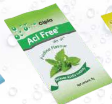
ACI FREE (PUDINA)