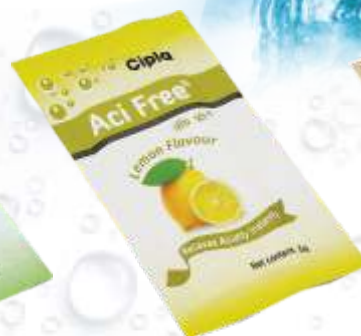
ACI FREE (LEMON)