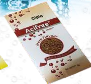
ACI FREE (JEERA)