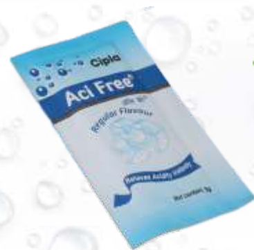
ACI FREE (REGULAR)

Svarjiksara (Shudh) 2.90g, Nimbukamlam (Citrus Medica) 2.10g